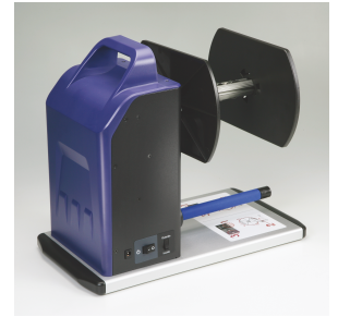
Stylish appearance plus a rugged design for long term reliability