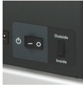
Rewinding direction switch to rewind "inside or outside" label rolls