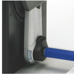
Colored LED indicator provides rewriter operation status