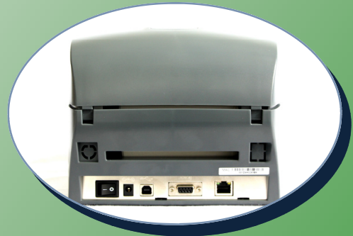
USB, Ethernet, and Serial communications ports

Full version EASYLABEL ® Start software, Windows Drivers, and CUPS Drivers included!