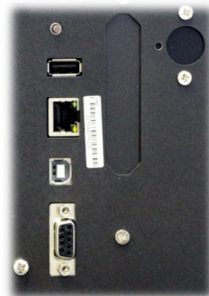
Multiple interface ports standard USB host port for standalone