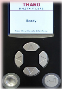
Color LCD and button panel for easy configuration

From the creators of EASYLABEL® the Tharo H-Plus Series is a robust industrial barcode label printer in the mid-level price range.